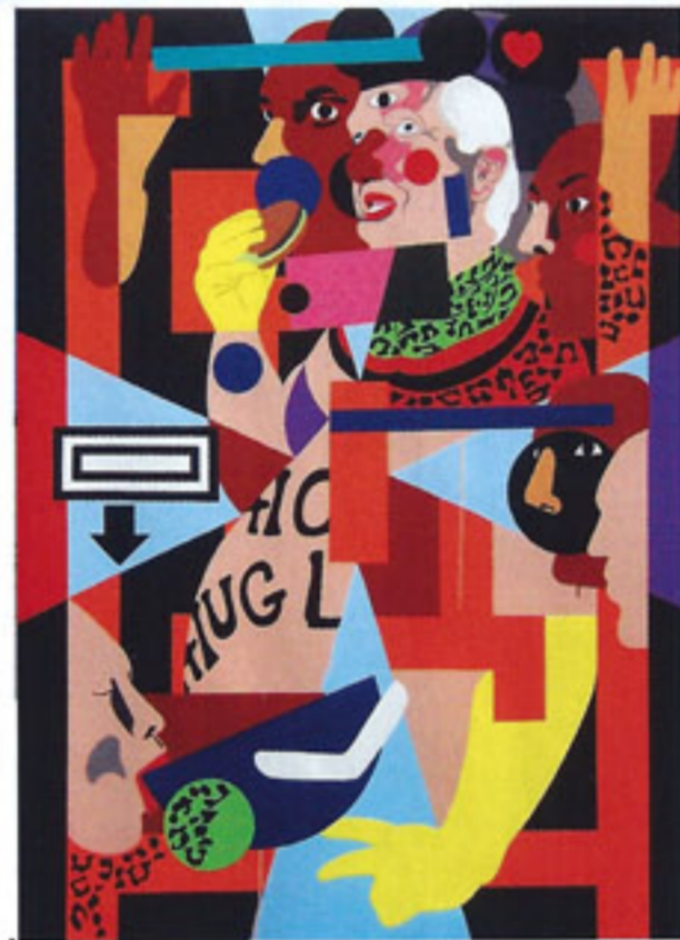
◀ NINA CHANEL ABNEY UNTITLED (DISORDER), 2012