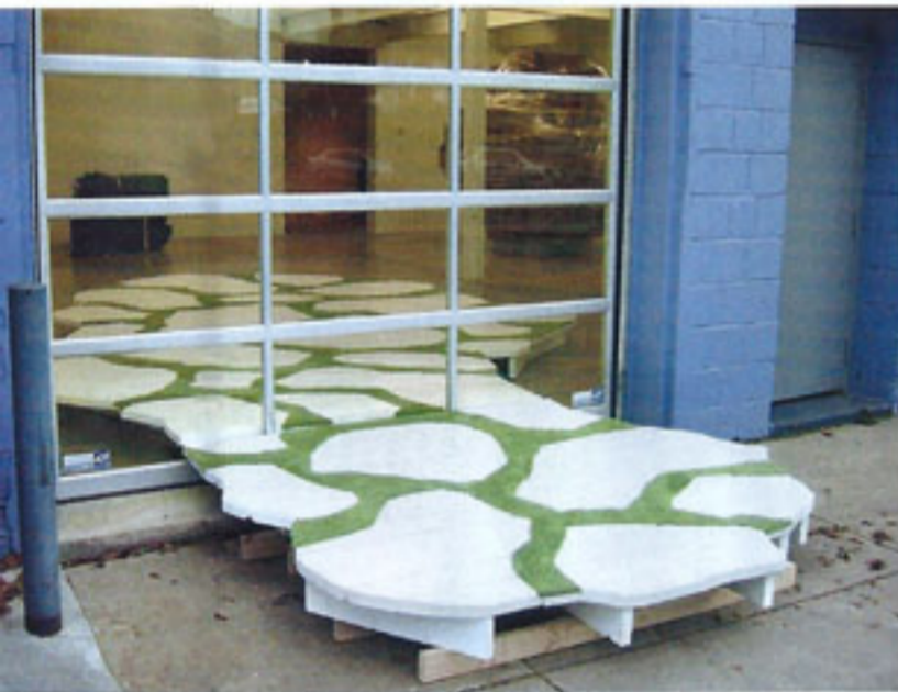
▲ OONA STERN PATIO, 2006